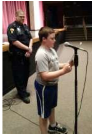
Two of the top DARE Essay winners reading their DARE reports.

We continue to support the DARE training in all of the schools in the City of Portage not only for the educational value but for the bonding that takes place between the officer and the students.