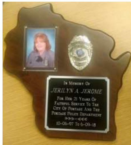
PLAQUE GIVEN TO JERILYN'S FAMILY; A SECOND PLAQUE IS HANGING ON OUR MEMORIAL WALL